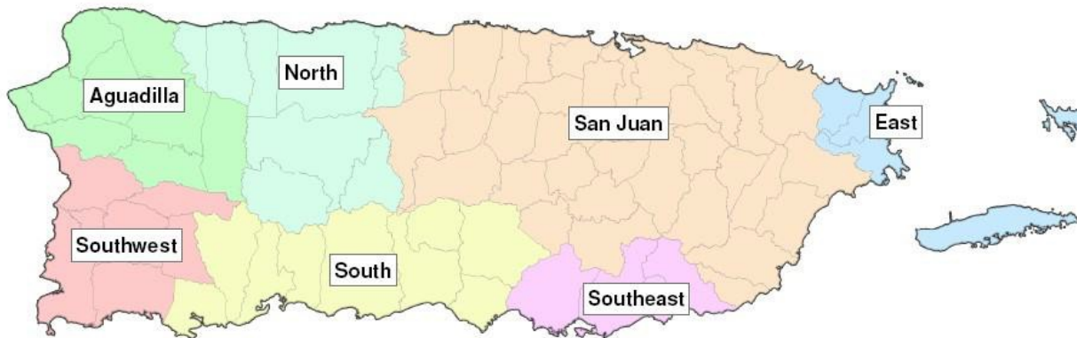
Figure 3: Transportation Metropolitan Areas and Transportation Planning Regions