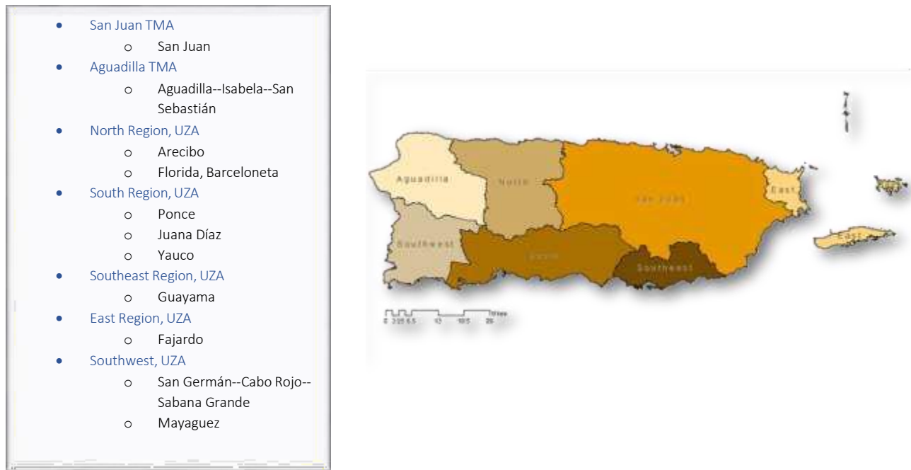
Figure 1. Transportation Planning Regions (TPRs)