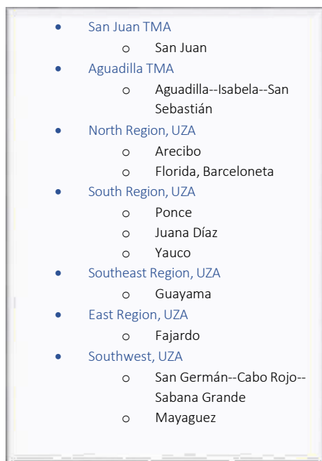
Figure1. Transportation Planning Regions (TPRs)