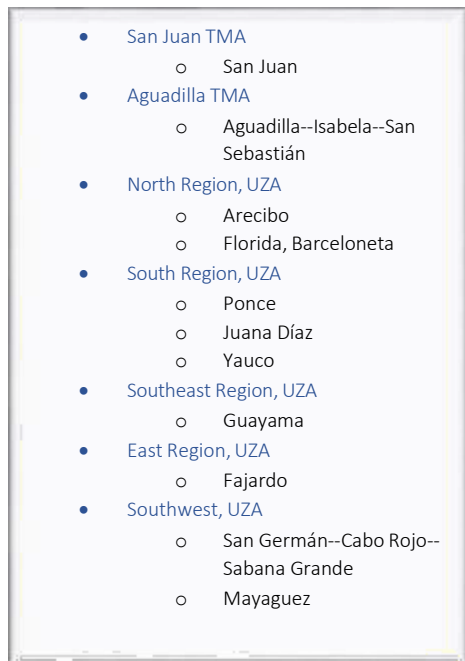
Figure1. Transportation Planning Regions (TPRs)