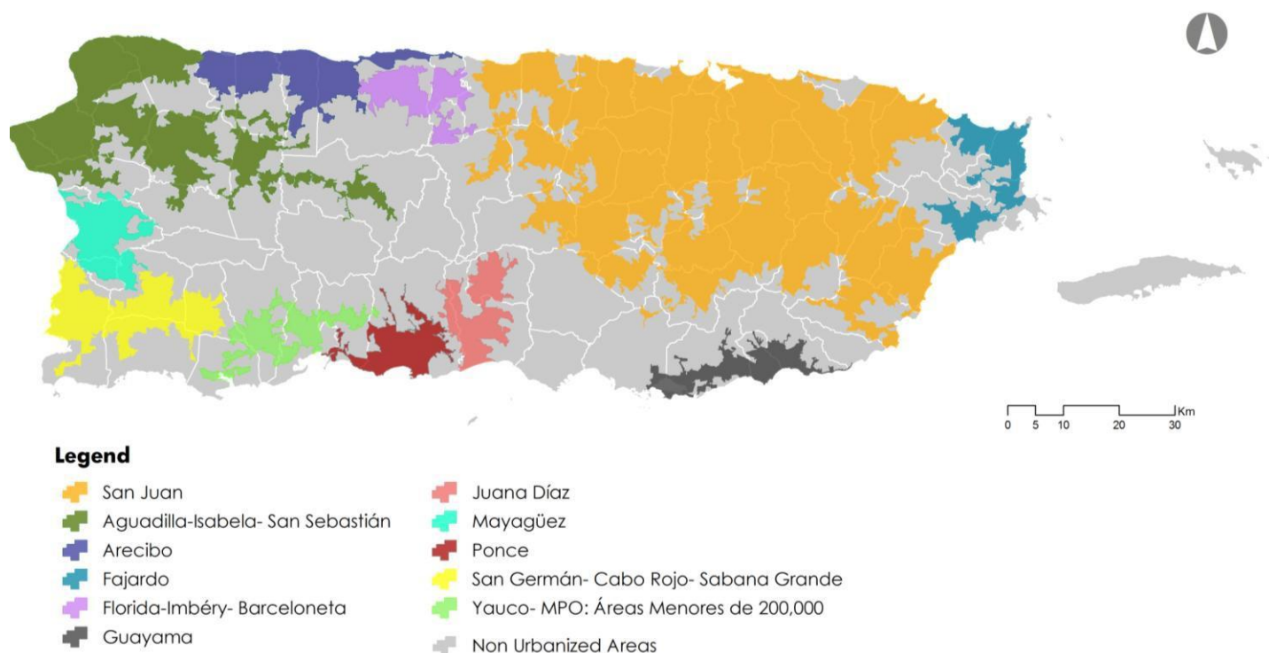
Figure 2: Urbanized Areas defined by the 2010 Census