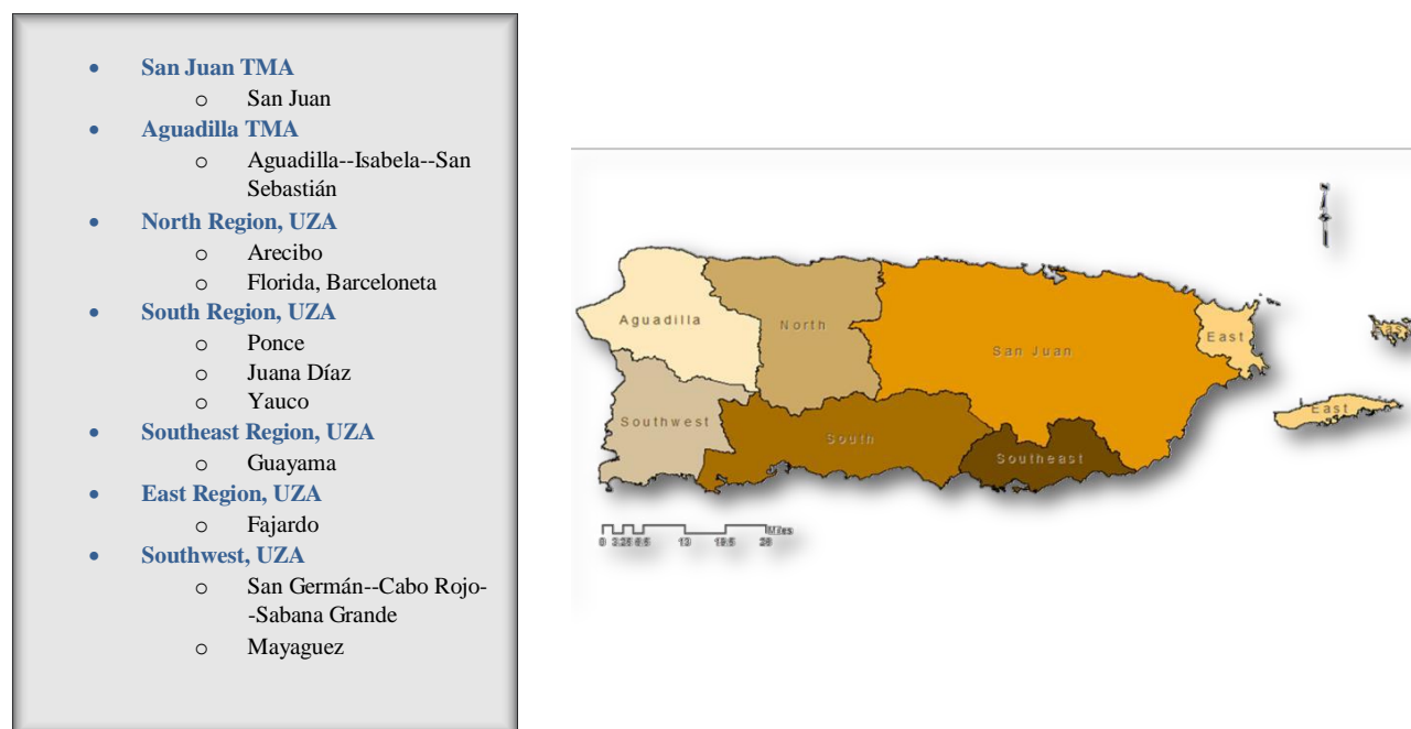
Figure1. Transportation Planning Regions (TPRs)

This Strategic Planning Research Program consolidated tasks 616, 617, 618, 619, and 634 into task 622 as Urbanized Areas (less than 200,000 inhabitants) or UZAs. Task 614 continues as San Juan Transportation Management Area, and Task 615 as Aguadilla Transportation Management Area. Moreover, it adds a new project as Puerto Rico Freight Strategic Plan.